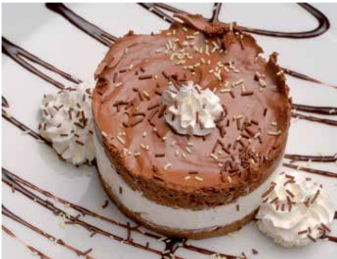
ČOKO ČIZKEJK CHOCCHO CHEESECAKE