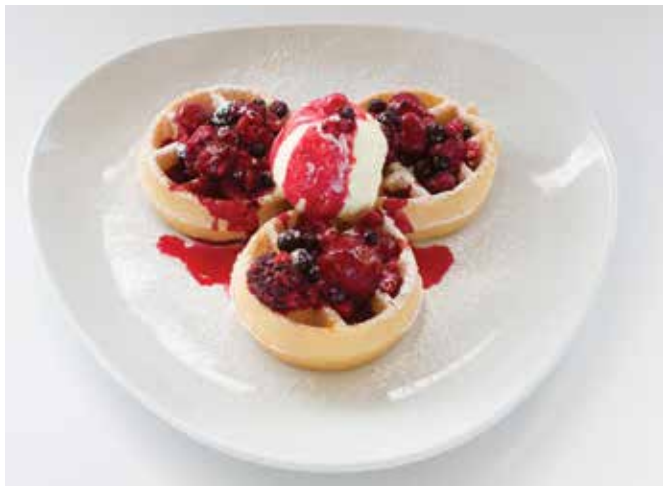
VAFLA SA VOĆEM • FRUIT WAFFLE šumsko voće / with forest fruit