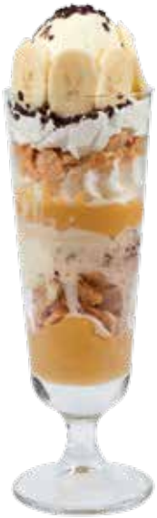
BANANA CARAMEL CRUNCH