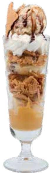
CARAMEL COOKIE CRUNCH