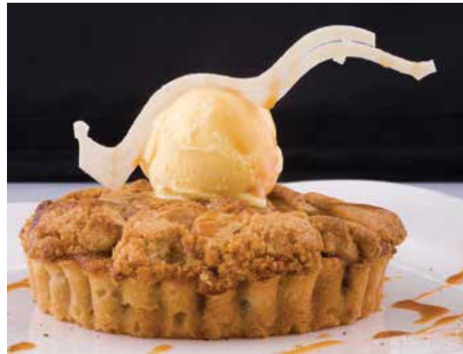
AMERIČKA PITA SA JABUKAMA AMERICAN APPLE PIE