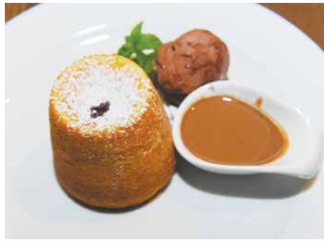
VULKANO • VOLCANO sa čokoladom od narandže / with chocolate orange