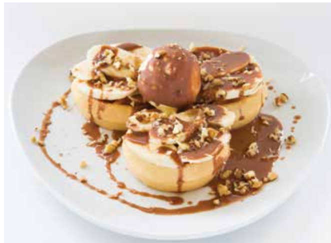
VAFLA SA VOĆEM • FRUIT WAFFLE banane i orasi / with bananas and walnuts